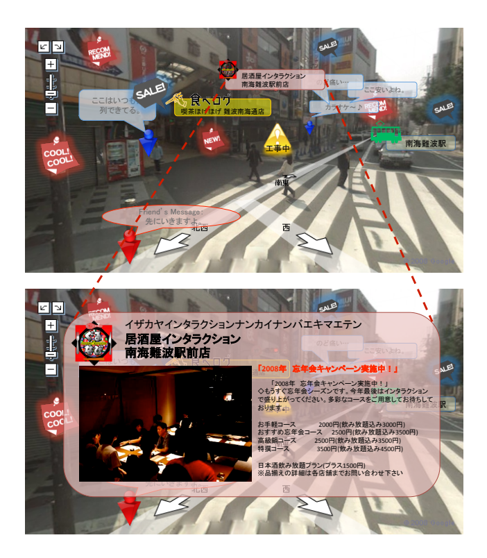
Fig. 1. Client System Overview

client system with the linked device to augment various functionalities. Among the possible scenarios, a CollabLink may be connected to the public big display device that also appears in the Street View image. In this case, after clicking the CollabLink icon, the big display device can be used for displaying or replaying any view and contents in the client system. Such display can be used to leave a public BBS in collaboration with other users for exchanging information around that spot.